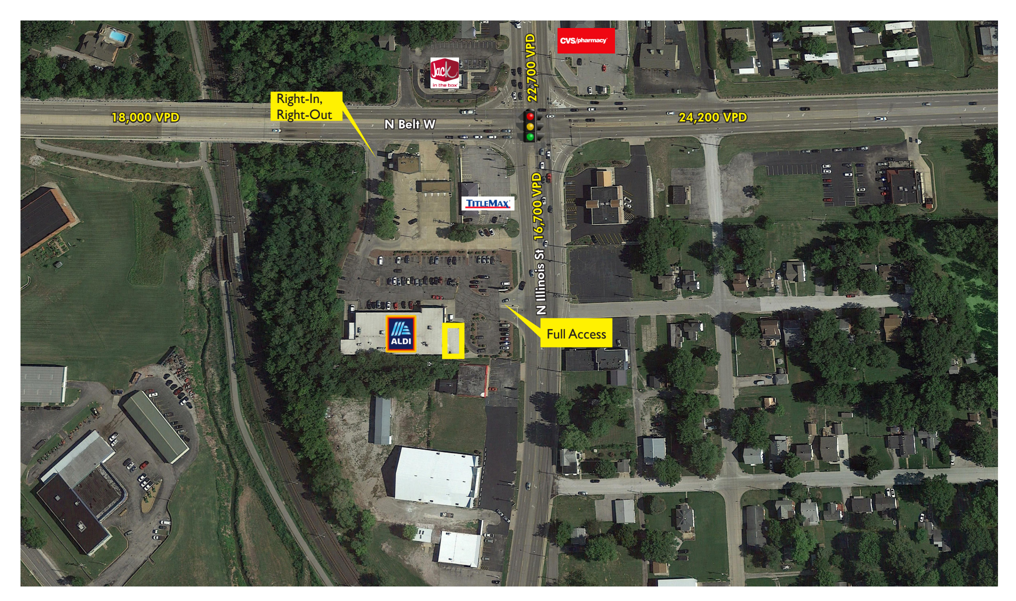
© 2019 CBRE, Inc. All rights reserved. This information has been obtained from sources believed reliable, but has not been verified for accuracy or completeness. You should conduct a careful, independent investigation of the property and verify all information. Any reliance on this information is solely at your own risk. CBRE and the CBRE logo are service marks of CBRE, Inc. All other marks displayed on this document are the property of their respective owners, and the use of such logos does not imply any affiliation with or endorsement of CBRE. Photos herein are the property of their respective owners. Use of these images without the express written consent of the owner is prohibited.